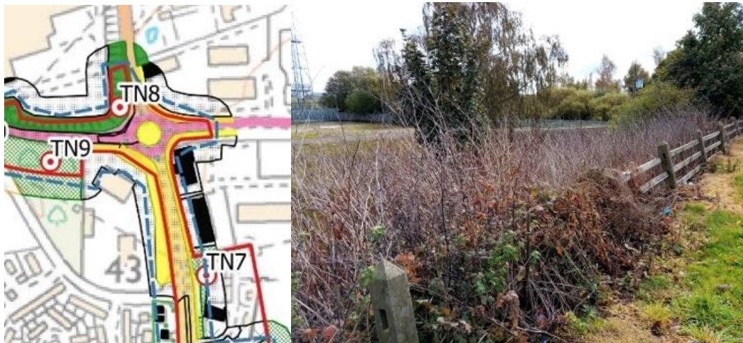
Figure 2: Location (TN7) and photograph of Japanese knotweed within Order Limits

4.3.2.1 A sizeable stand of Japanese knotweed is present at a single location within the Northern District Heat and Private Wire Network (DHPWN) Land (TN7). This is located adjacent to an electric substation and east of Normanby Road. It is well-established and growing vigorously. Rhizomes are likely extensive and have spread into the adjacent amenity grassland.