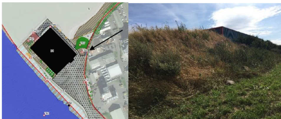
Figure 1: Location and photograph of Himalayan balsam within Order Limits

4.2.2.1 Himalayan balsam has been identified at a single location within the Railway Reinstatement Land, growing amongst tall ruderal vegetation on a raised earth bund beside a building on the north-west side of the Flixborough industrial estate (Figure 1). Surveys also noted additional areas of Himalayan balsam along the River Trent, however these are outside of the Order Limits.